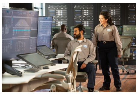
Advanced Machine Learning to Measure and Improve Operator Performance.

Mobile workers get access to relevant information from control and safety systems, historians and even enterprise resource planning systems for essential context, insight, and guidance to do their jobs better and faster.