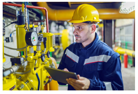
Analyze Competency and Behavior Insights by Linking Operational Data to Workers Actions.