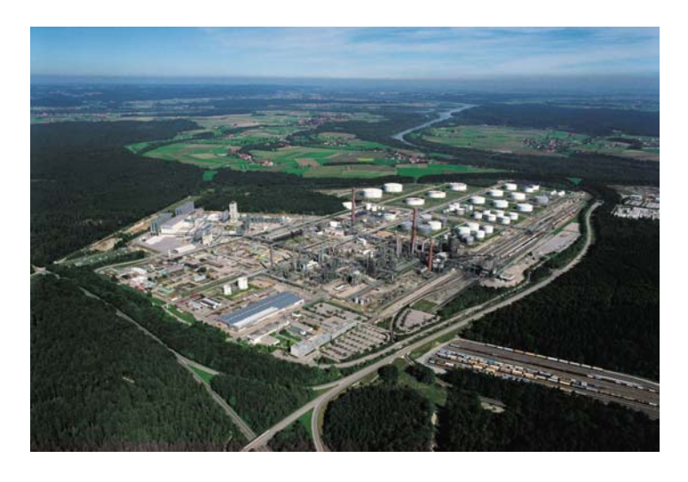
Plant site, OMV Burghausen

The common objective of all involved is therefore to minimise the shutdown period, as a start-up delay costs additional 1 million Euros per day.