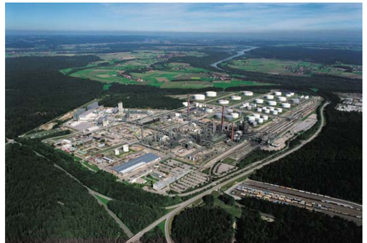
Plant site, OMV Burghausen

The common objective of all involved is therefore to minimise the shutdown period, as a start-up delay costs additional 1 million Euros per day.