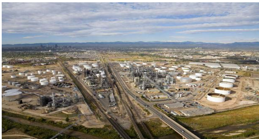
Figure 1. Located just outside Denver, Suncor's Commerce City refining complex has a combined capacity of 90,000 BPD.

Located just outside Denver, with a combined capacity of 90,000 BPD, the Commerce City complex is the largest refining operation in the Rocky Mountain region. In 2006, Suncor completed a $445 million upgrade allowing the refinery to produce refined products that meet newly regulated emission levels for low-sulphur diesel fuel. The modernization also enabled the refinery to integrate a broader slate of crude oil products, including sour crude oil from the company's Canadian oil sands production (See Fig. 1).